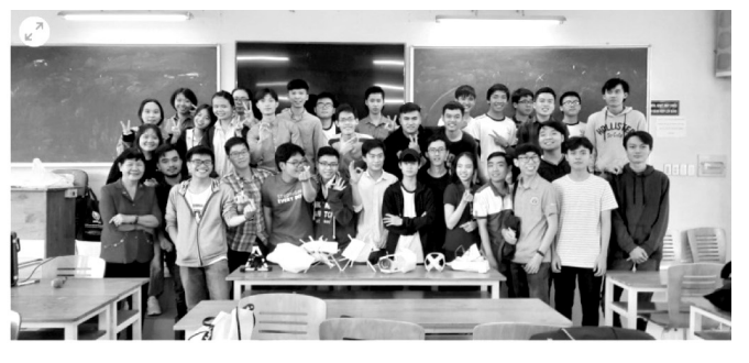
Figure 2: Building a flying egg system - Systematic Thinking Class - SYTH220505E - Group 01CLC